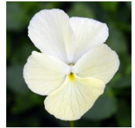
Ivory Queen (H)