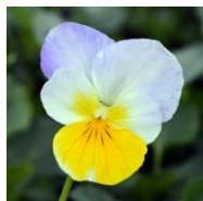
Smugglers Moon (H)