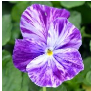
Elaine Quin (H)