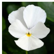
White Swan (H)